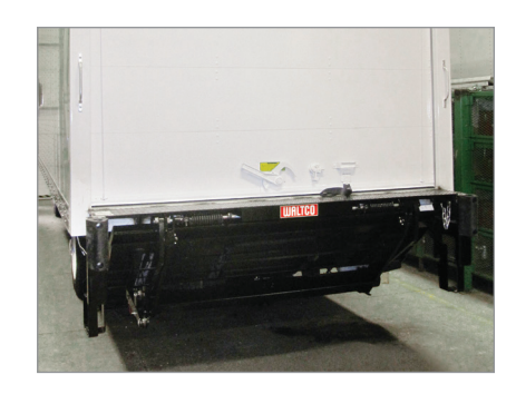
EM Series Gate in stowed position