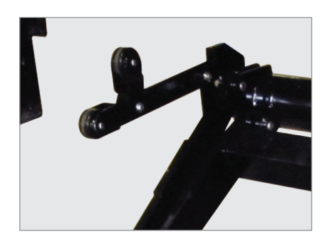
Bolt-on parking bar shown above.