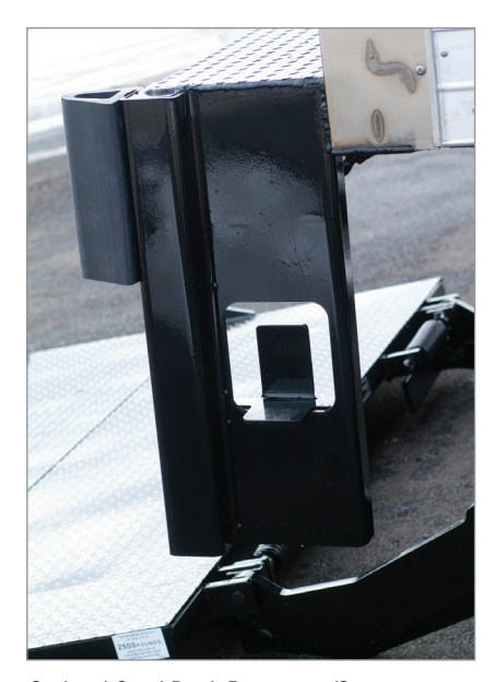
Optional Steel Dock Bumper w/Step and Rubber Pad.