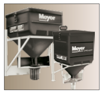
In 1999 black thermoplastic replaced fiberglass on the hopper.