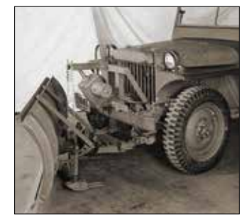
Designed the first plow for 4-wheel drive vehicles.