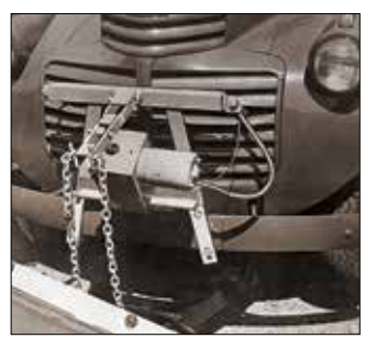
Developed the T-1 Electric Hydraulic Lift, the first ever.