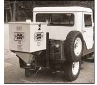
In 1972 the Meyer "Mini Spreader" was introduced. The perfect size to control ice where the big trucks couldn't.