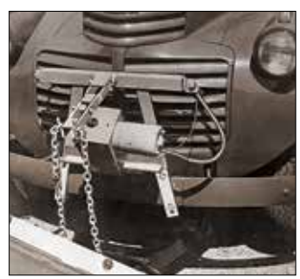
Developed the T-1 Electric Hydraulic Lift, the first ever.