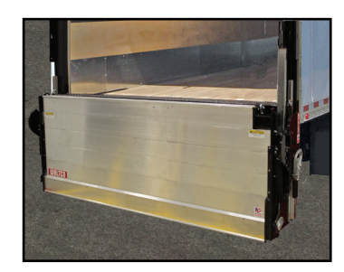
Large folding platform stores at bed height to provide rear door access and convenient dock loading