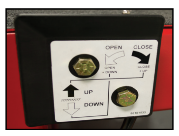
Gravity open, power close