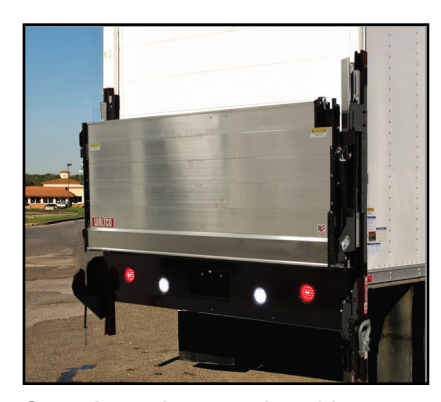
Gate shown in stowed position