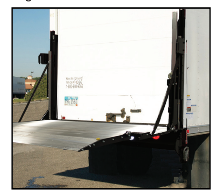
Above-floor, bed height view

Easier handling of wheeled carts, bins, and racks with this level-ride liftgate.