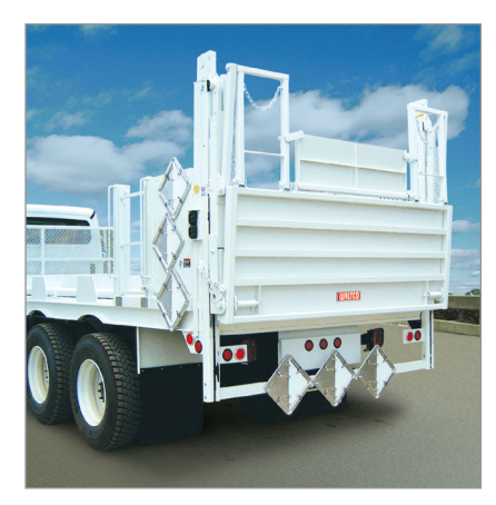
RBGL Series Gate in stowed position

Efficient solution to managing oversized bottled gas loads, on or off dock with ease.