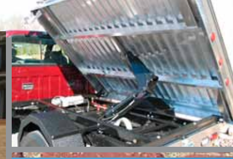
Screened Bulkhead w/Handgrips & Top Rack