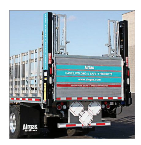
WDVBG Series Gate in stowed position offers simplicity and reduced maintenance